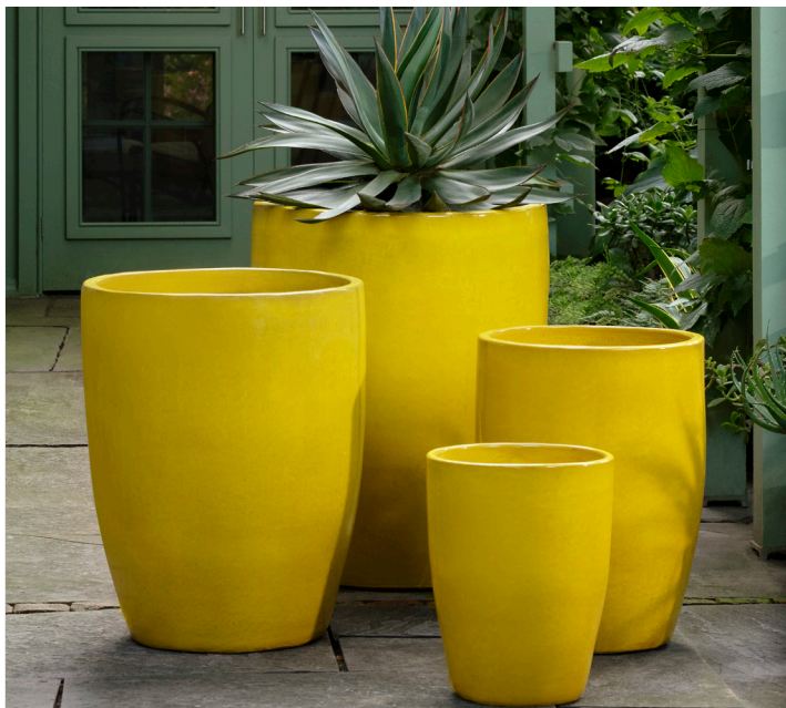
Shown in Limon