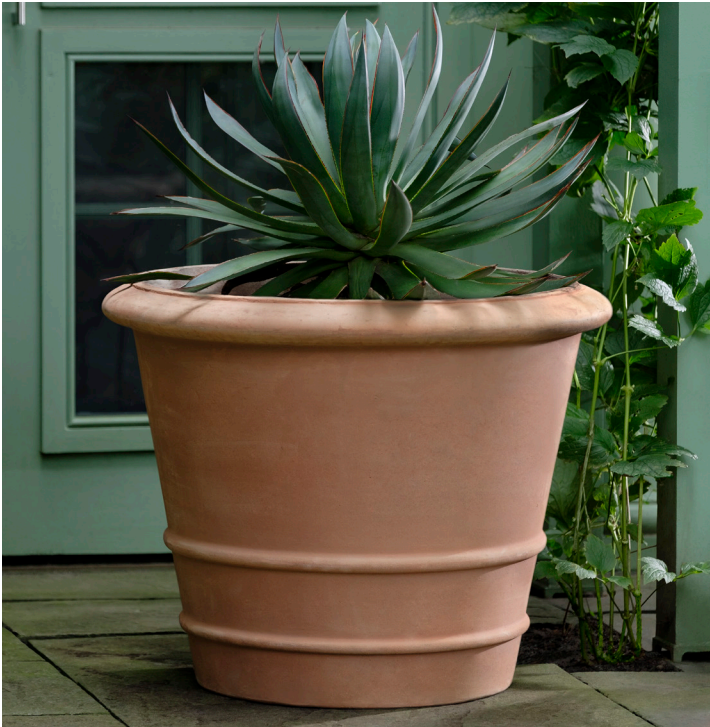
Shown in Terra Cotta