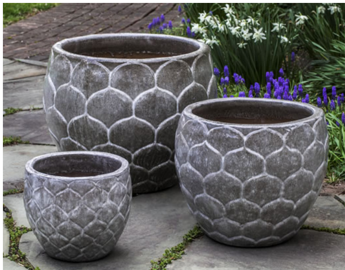
Shown in Snow Monkey