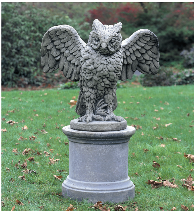
PD-108 shown with A-267 in Alpine Stone