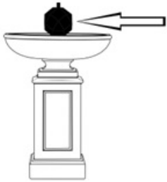
FT-420A (56 lbs) 10"W x 12.5"H

Note: There are small water channels on one lip of the pump cover. That side of the pump cover should rest at the bottom of the urn to allow efficient water to flow back to the pump.