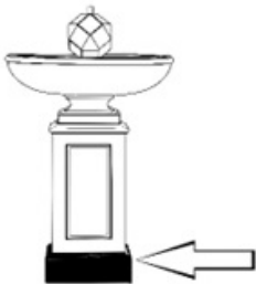
FT-420C (142 lbs) 19.25"W x 7"H

Assemble your fountain on a level surface capable of holding a minimum of 1035 lbs with an approximate 2.5 sq. ft. footprint (approximately 19" x 19").