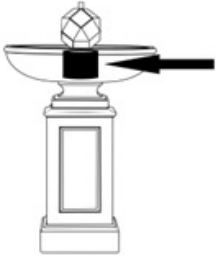
FT-420B (15 lbs) 8.75"W x 6"H

Step 7 - Center the pump cover (FT-420B) inside the urn (P-964).