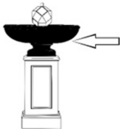
P-964 (239 lbs) 39.25"W x 16.5"H

6a - NOTE: Using the handle of a screwdriver or hammer works best to press the stopper in place.