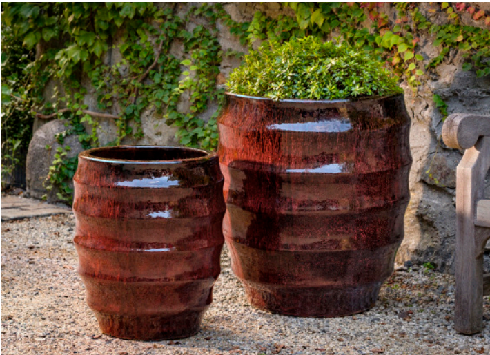
Shown in Bordeaux