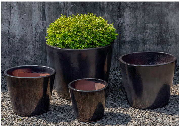
Shown in Cola