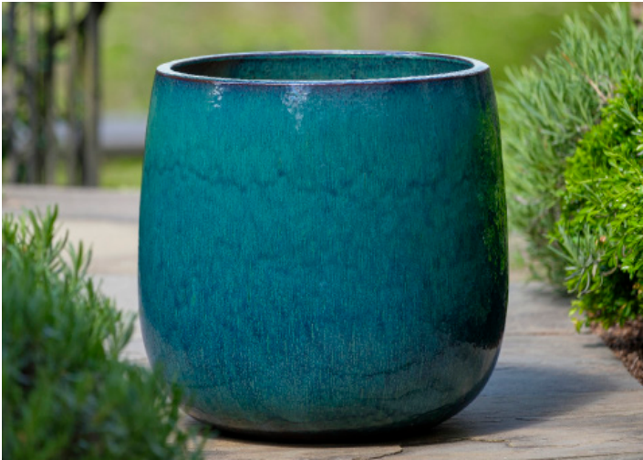
Shown in Indigo Rain