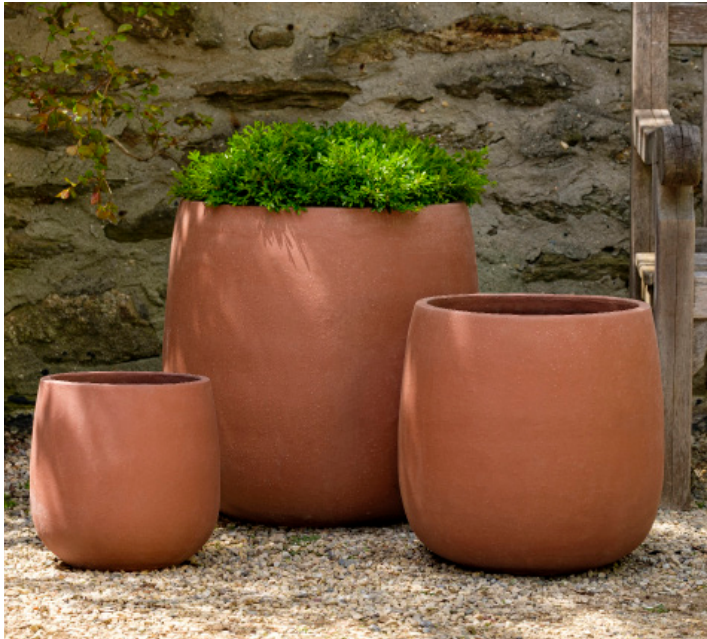
Shown in Terra Rosa