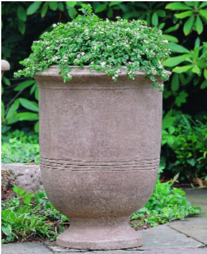
Shown in Pietra Nuova