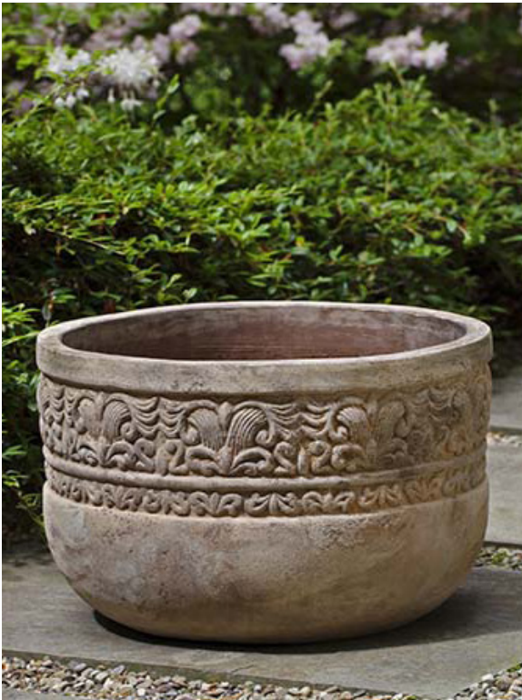
Shown in Antico Terra Cotta