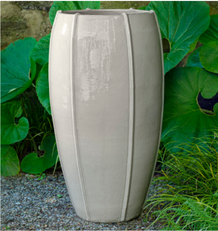
Shown in Cream