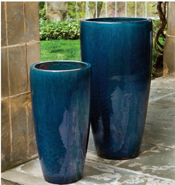
Shown in Indigo Rain