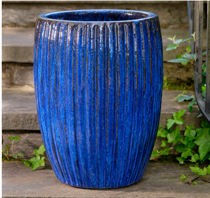
Shown in Riviera Blue