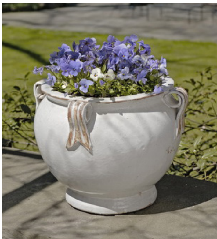
Shown in Antique White