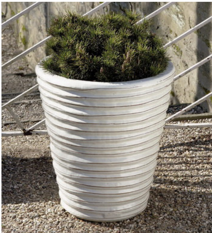
Shown in Antique White