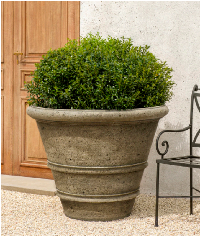
P-902 shown in Alpine Stone