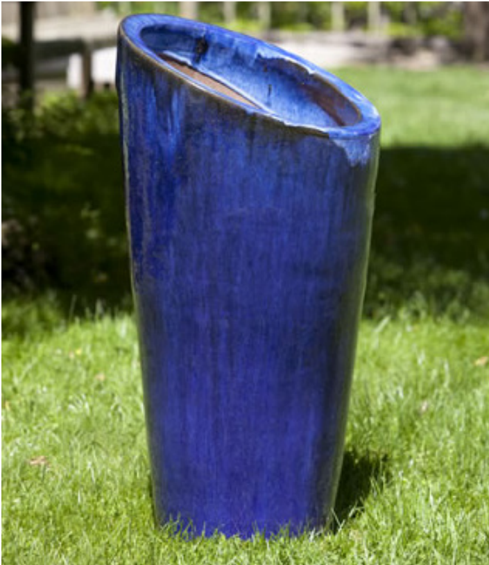
Shown in Riviera Blue