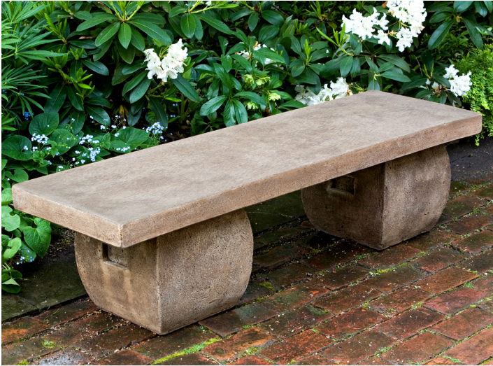
Shown in Brownstone