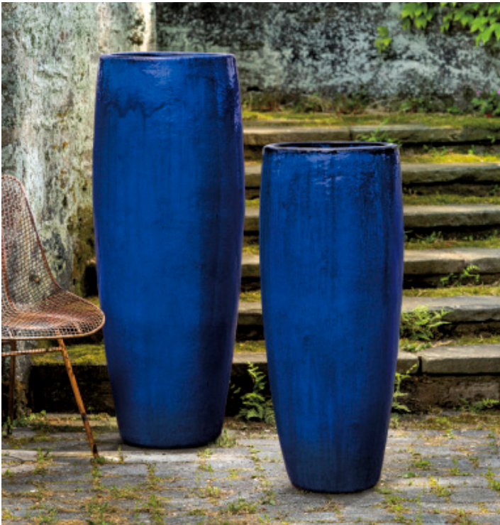
Shown in Sapphire