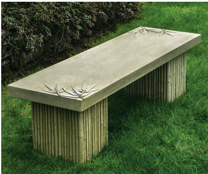
Shown in English Moss