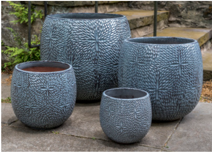
Shown in French Blue