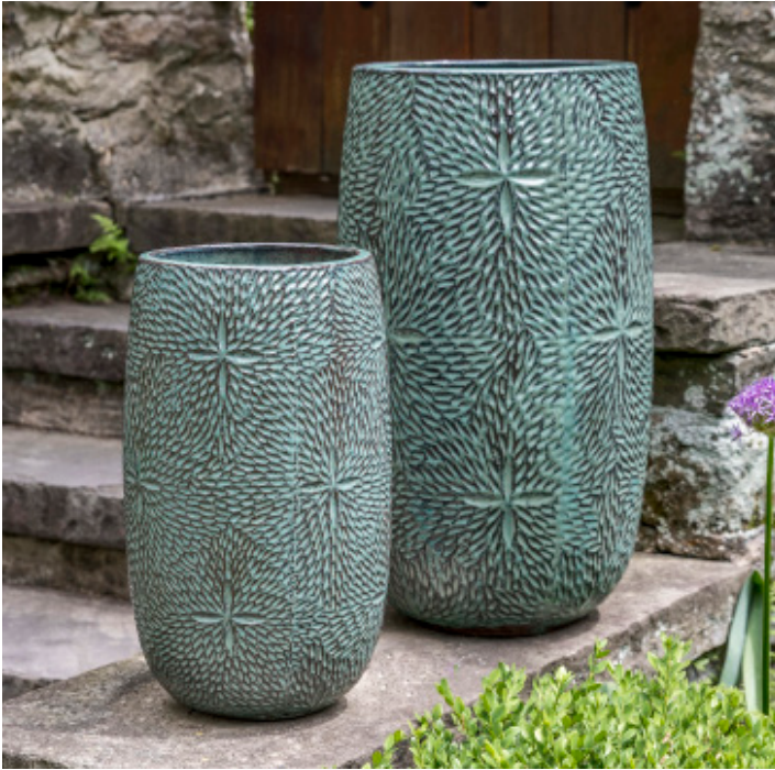
Shown in Seafoam Green