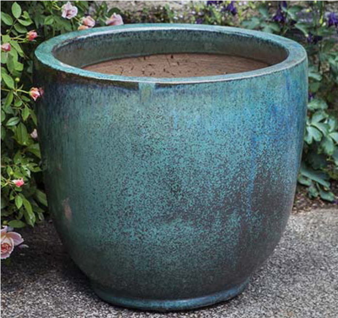
Shown in Weathered Copper