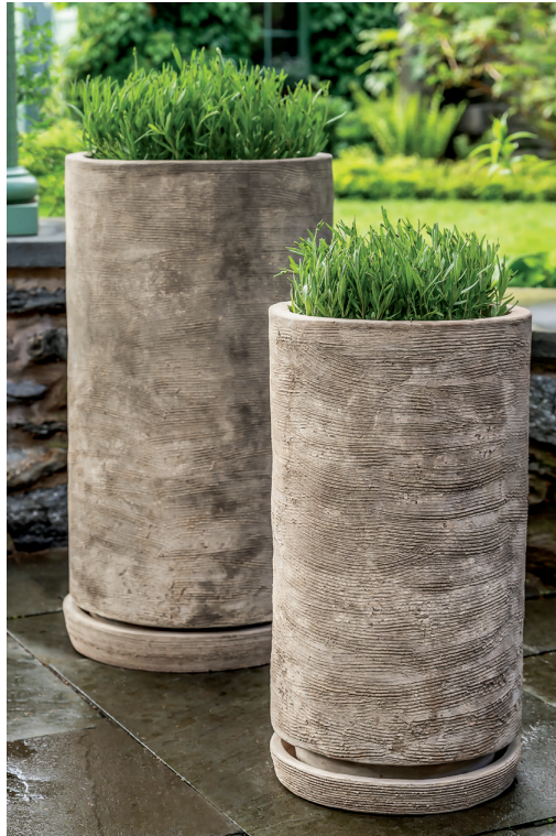
Shown in Antico Terra Cotta