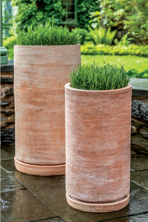
Shown in Terra Cotta

Please note that actual colors may vary slightly from those depicted here.