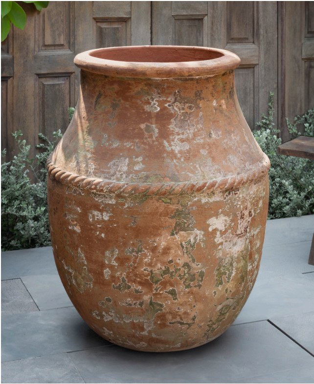
Shown in Vicolo Mattone