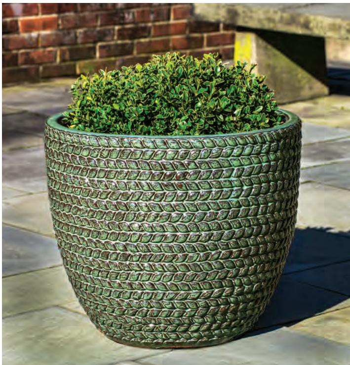
Shown in Seafoam