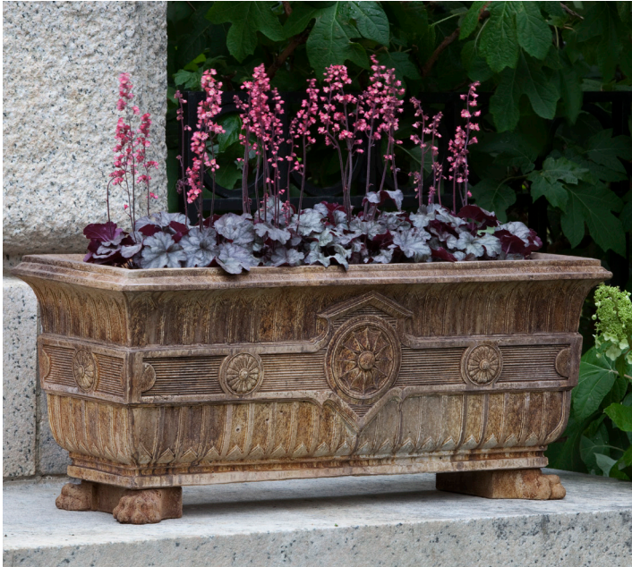
Shown in Ferro Rustico Nuovo

Available in a choice of thirteen (13) exclusive natural pigment stains in addition to natural. All of our patinas are hand applied in a multi-step process which produces unique and beautiful surface finishes. Designed to replicate the look of naturally aged materials, the patinas will not prevent the natural aging process that occurs in an outdoor environment. Rather than creating uniform stains, our approach gives our products their unique beauty and appeal.