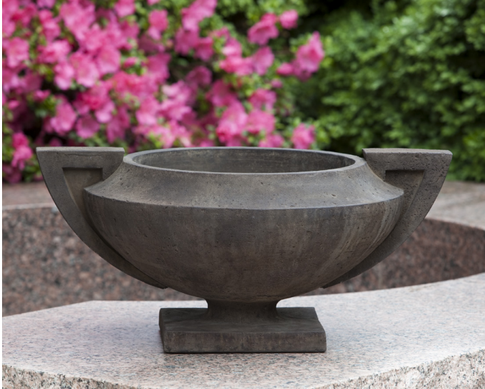
Shown in Nero Nuovo

Campania proudly manufactures its cast stone products in the USA using locally sourced materials. All of our cast stone pieces are manufactured using the wet casting technique with a proprietary high density cast stone mix, yielding a PSI strength of approximately 7,500. The mix is comprised primarily of water, sand, stone aggregate and cement. Our cast stone products may qualify for LEED credits as applicable to your project. Cast stone produces a strong and durable product that will weather naturally in an outdoor environment. Simply stated, cast stone is chosen for its beauty and authenticity. Our material is natural, authentic, made in the USA, and 100% recyclable. These planters are often specified for hospitality projects, large scale public space installations, pedestrian and traffic safety, and other custom projects. Although we recommend that you take advantage of the quick turnaround of our stocked product; these shapes, finishes, and/or sizes are not always right for every job. Campania has the capability to produce custom molds and colors in our Pennsylvania, PA factory.