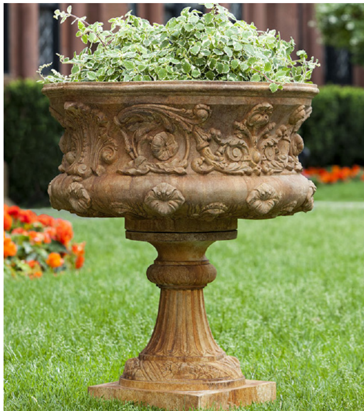
Shown in Ferro Rustico Nuovo