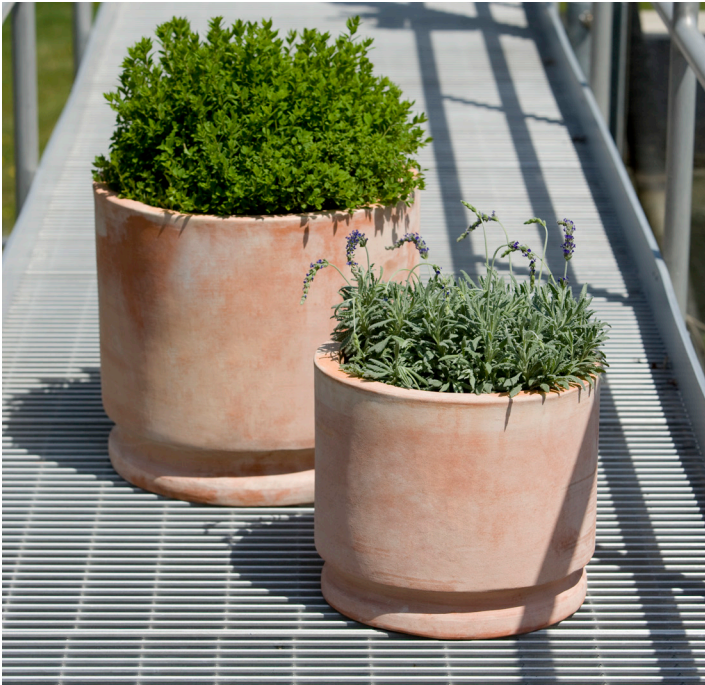
Shown in Terra Cotta