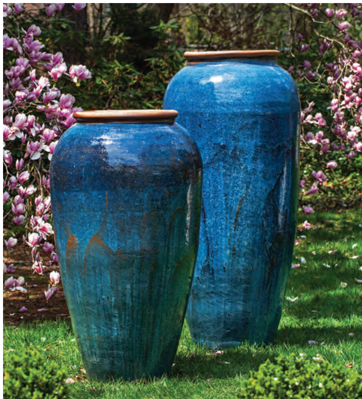
Shown in Rustic Blue