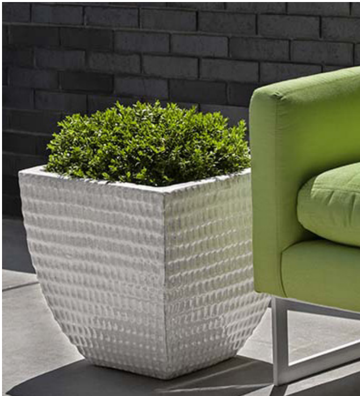
Shown in Antique White