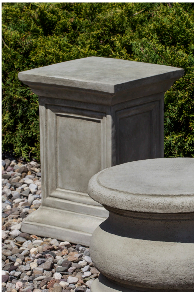
PD-32 shown in Alpine Stone