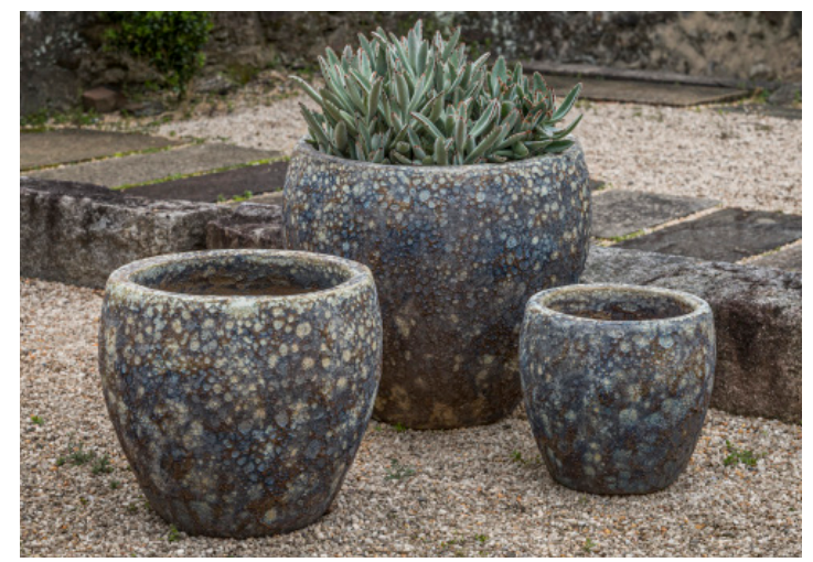
Shown in Starry Night