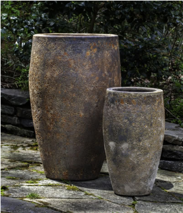
Shown in Angkor