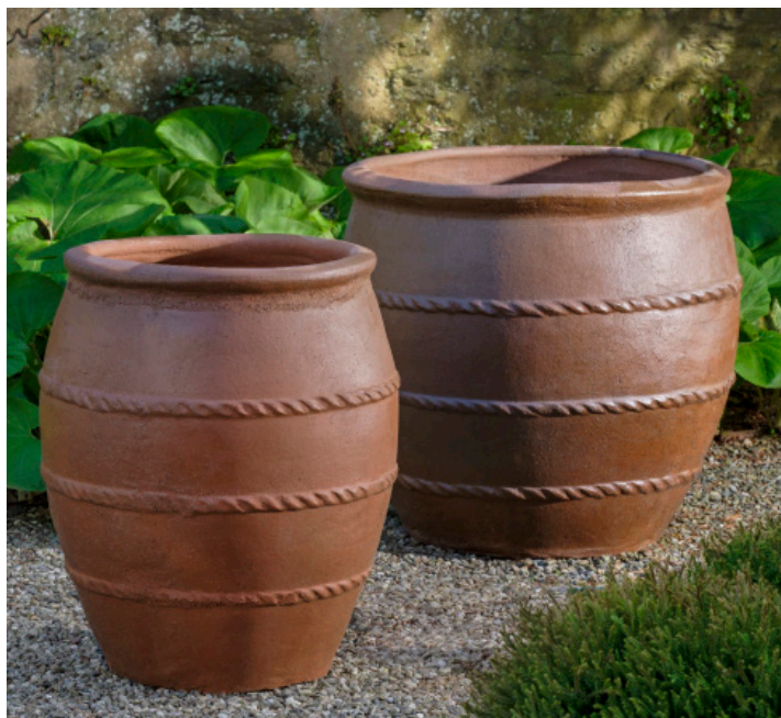
Shown in Natural Rustic