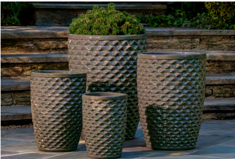
Shown in Fog