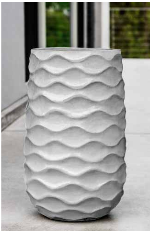
Shown in Snow