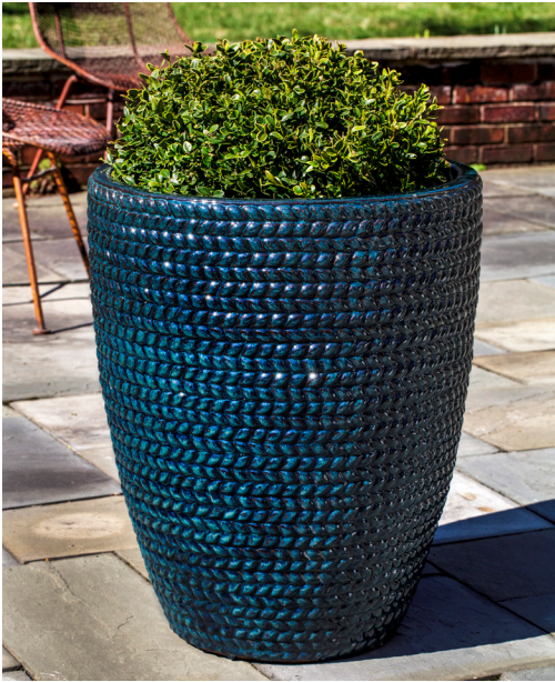
Shown in Indigo Rain