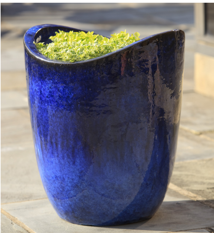
Shown in Riviera Blue