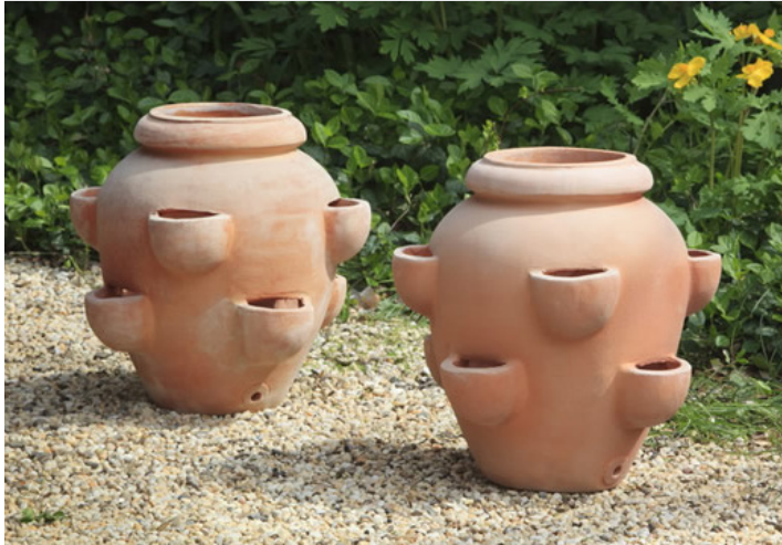
Shown in Terra Cotta