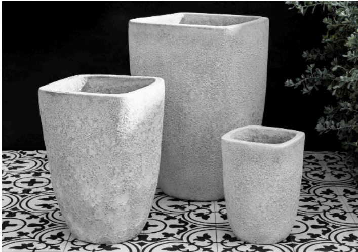
Shown in White Coral