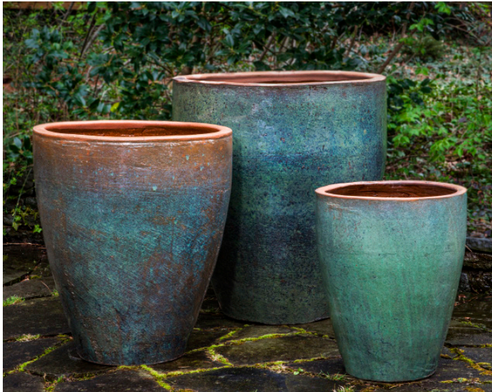
Shown in Rustic Green