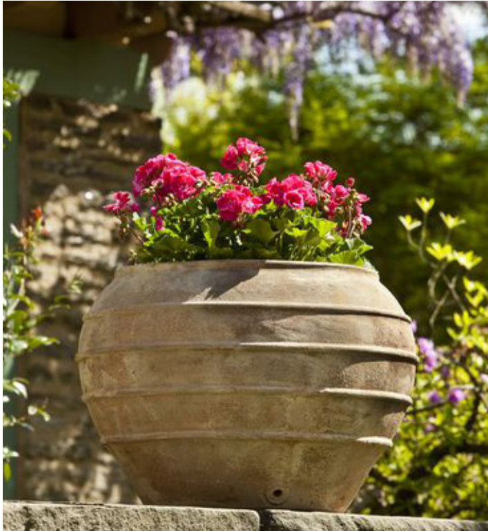
Shown in Antico Terra Cotta