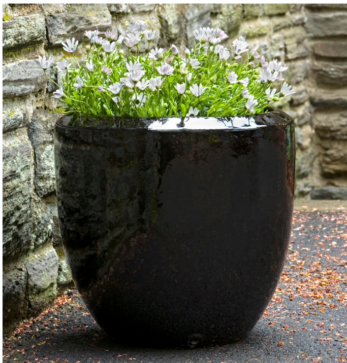
Shown in Cola