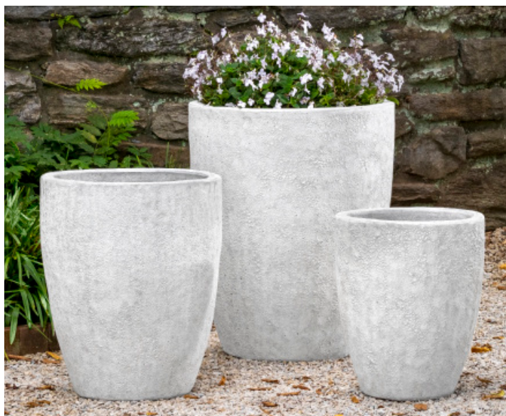
Shown in White Coral