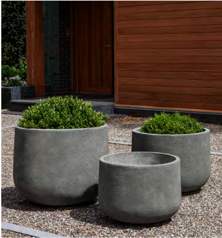
Shown in Greystone

Available in a choice of thirteen (13) exclusive natural pigment stains in addition to natural. All of our patinas are hand applied in a multi-step process which produces unique and beautiful surface finishes. Designed to replicate the look of naturally aged materials, the patinas will not prevent the natural aging process that occurs in an outdoor environment. Rather than creating uniform stains, our approach gives our products their unique beauty and appeal.