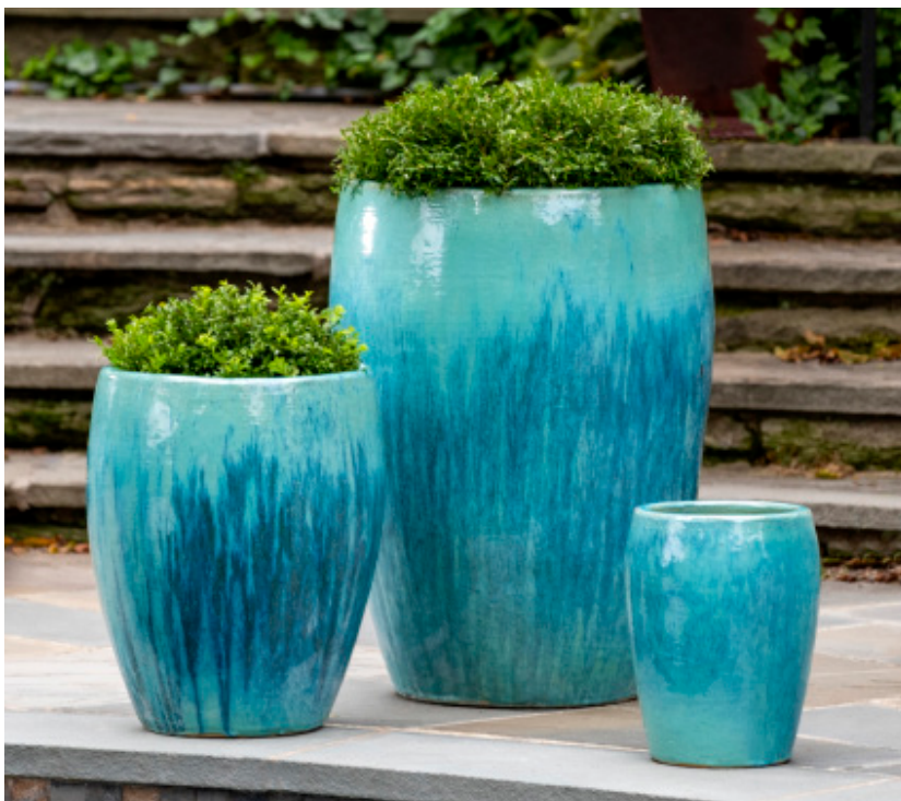
Shown in Antigua