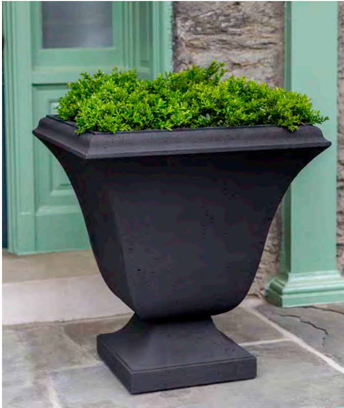
P-829 shown in Nero Nuovo

Available in a choice of thirteen (13) exclusive natural pigment stains in addition to natural. All of our patinas are hand applied in a multi-step process which produces unique and beautiful surface finishes. Designed to replicate the look of naturally aged materials, the patinas will not prevent the natural aging process that occurs in an outdoor environment. Rather than creating uniform stains, our approach gives our products their unique beauty and appeal.