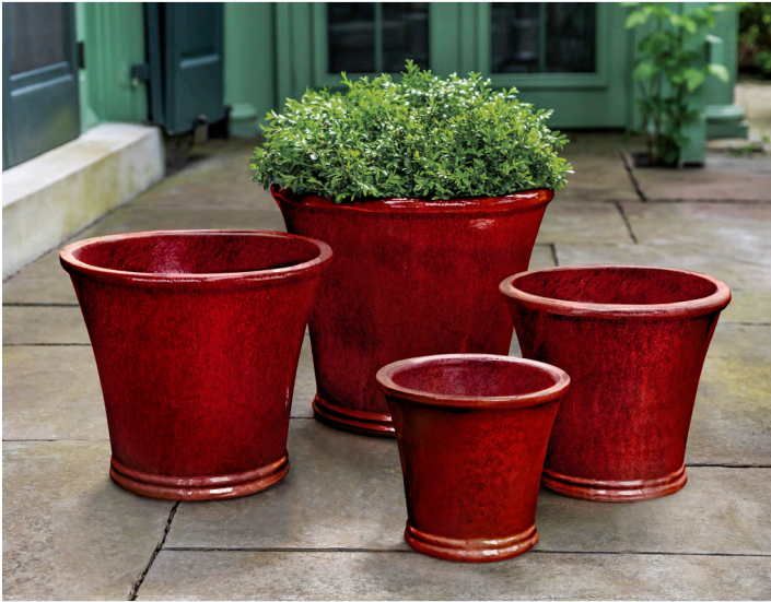
Shown in Barolo